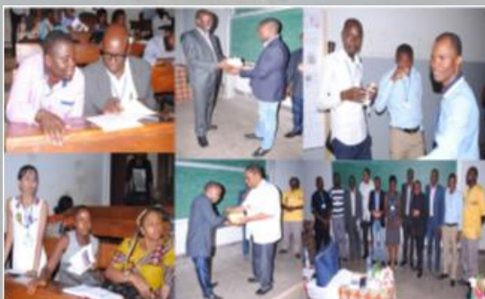
EGC 3 PARTICIPANTS, AWARD OF PRIZES

Guidelines and Template available at: http://www.egc-uy1.com/