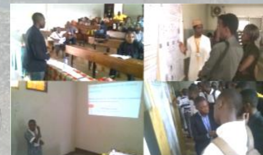
EGC 3 ORAL AND POSTER SESSIONS